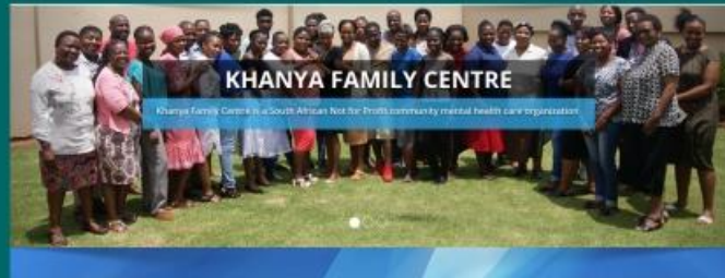
KHANYA FAMILY CENTRE, KATLEHONG, JHB