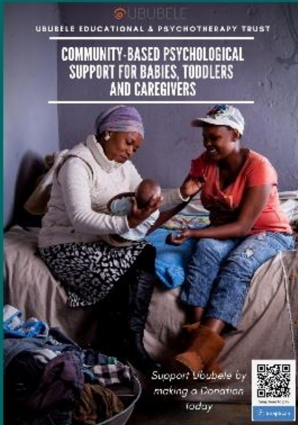
UBUBELE PSYCHOTHERAPY CENTRE ALEXANDRA, JHB