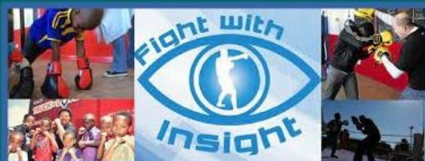
FIGHT WITH INSIGHT, BRAAMFONTEIN, JHB