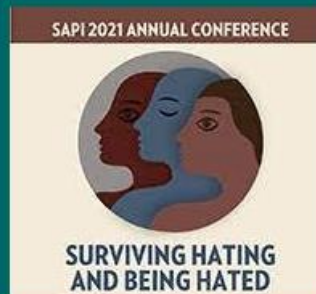
SAPI/SAPA LOW FEE SCHEMES JHB AND CPT