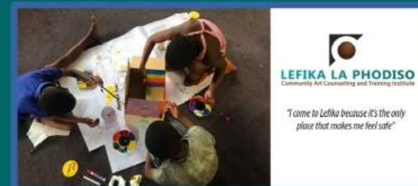
LEFIKA LA PHODISO ART THERAPY CENTRE, JHB