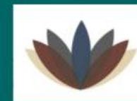
SUPERVISION AND SUPPORT FOR INTERNS AND COMMUNITY SERVICE PRACTITIONERS, JHB & CPT