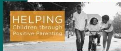
THE PARENT CENTRE AND HOME VISITING PROJECT, CPT